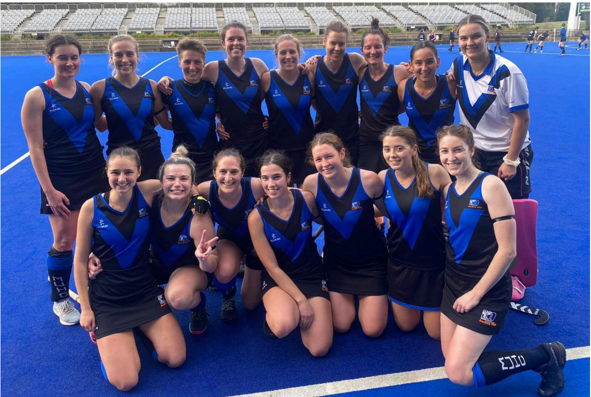
Women's Premier League