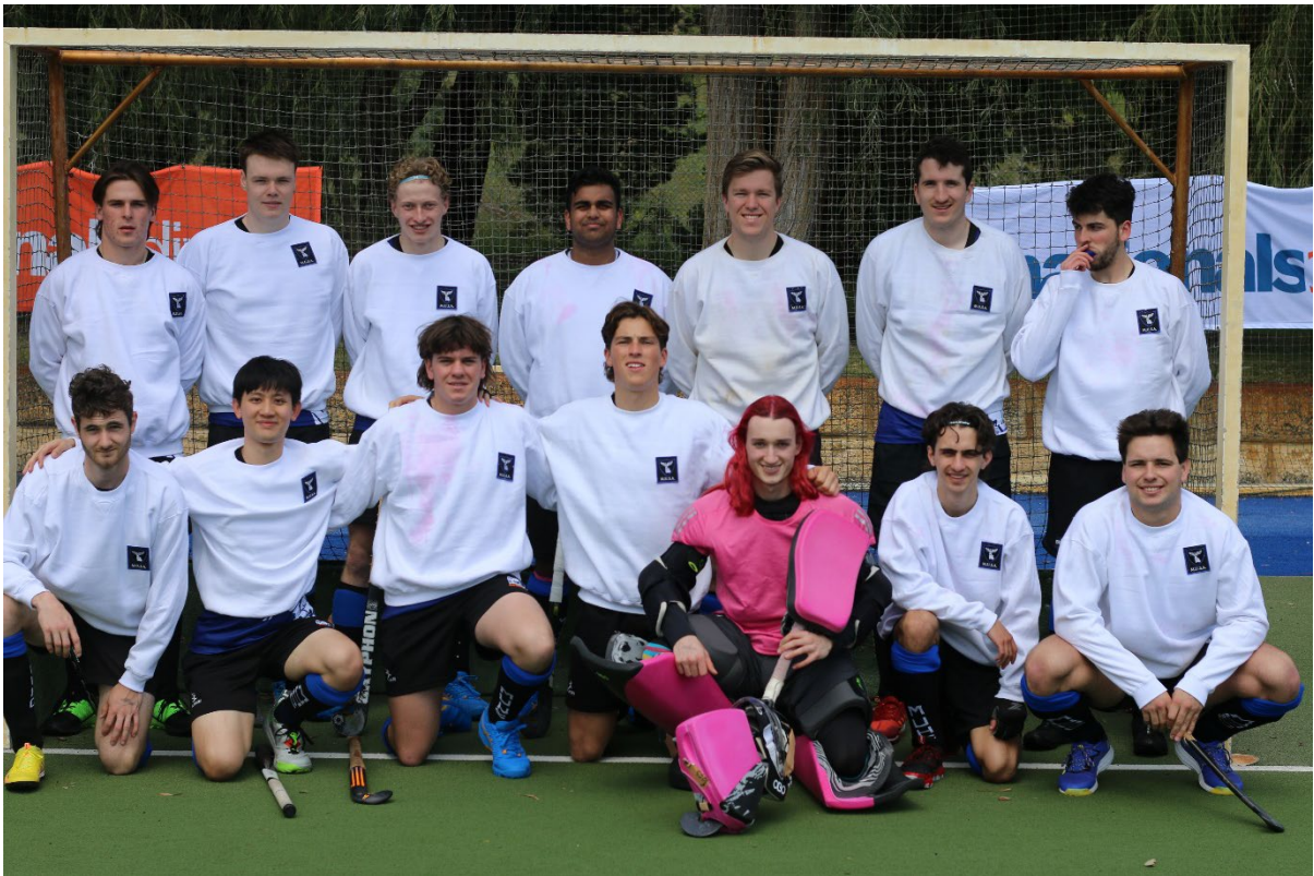
Men's InterVarsity – Bronze