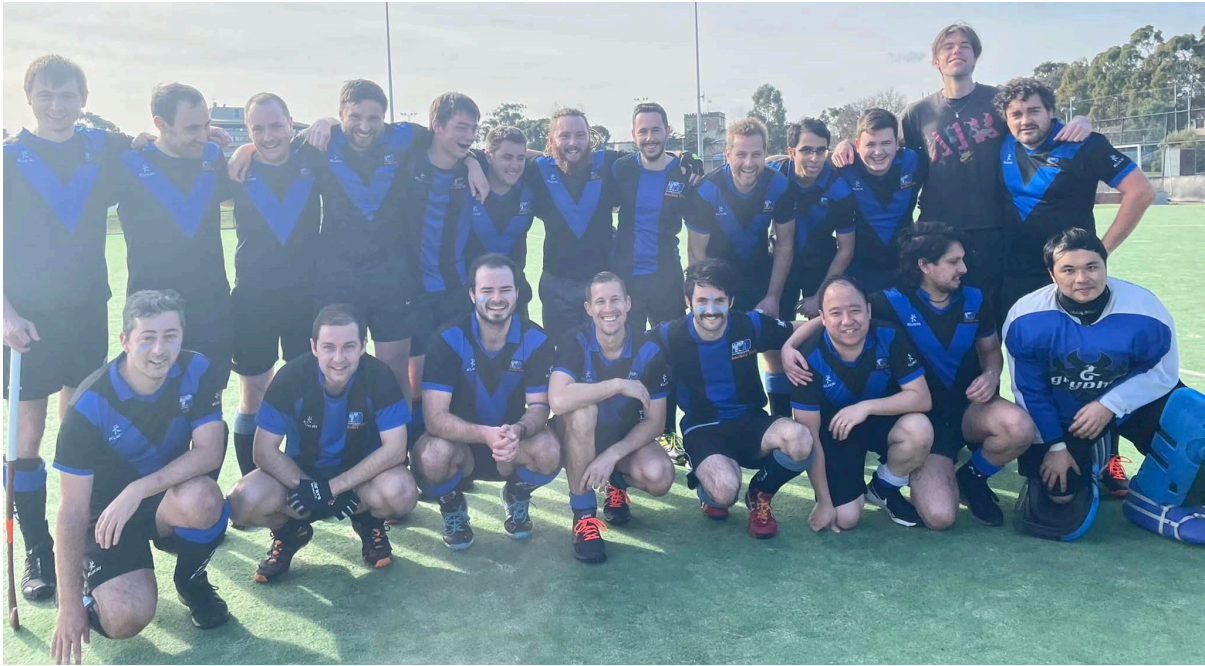
Men's Metro 2 (Men's Health Round)