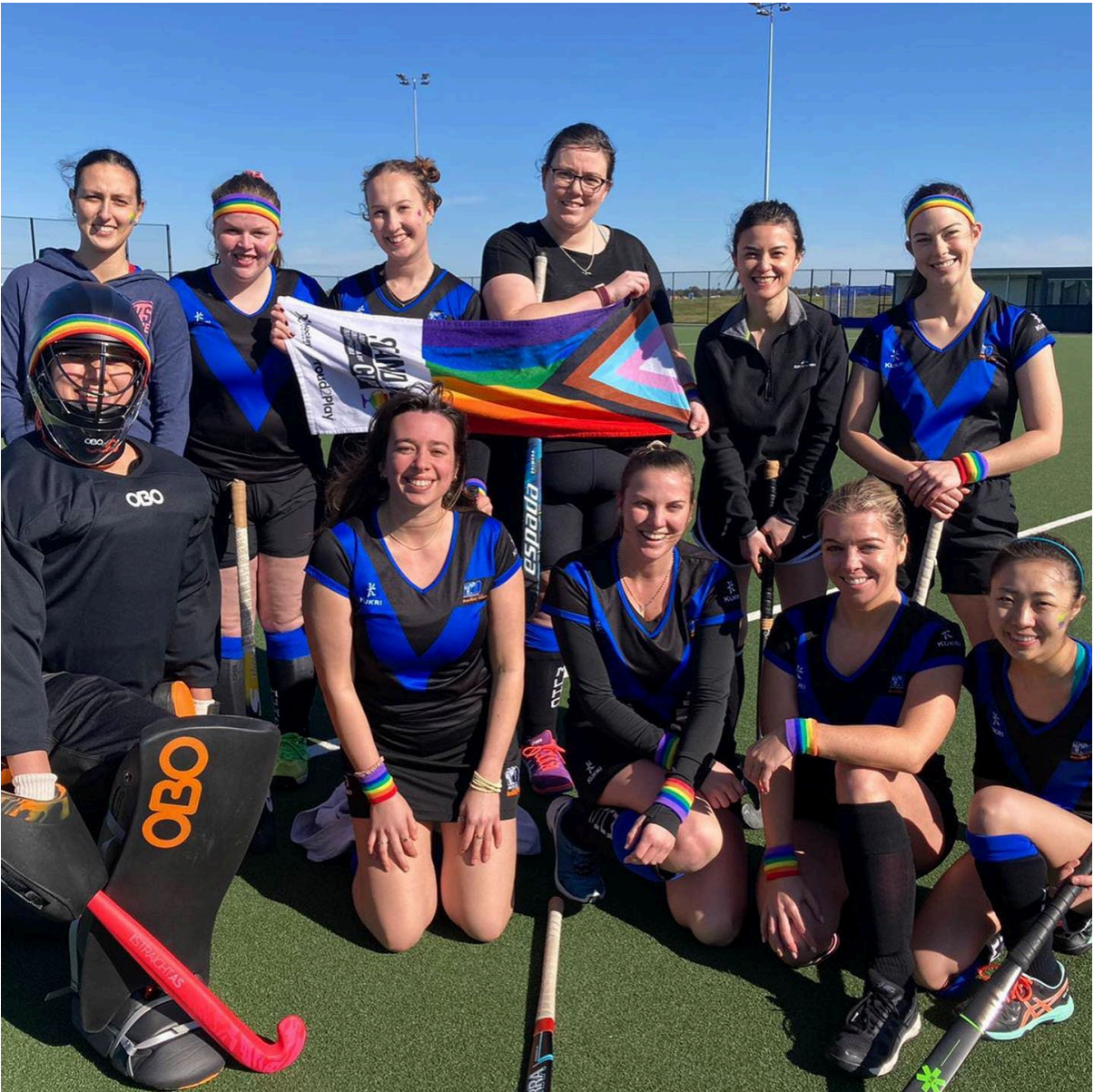
Women's Pennant E North West (Pride Round)