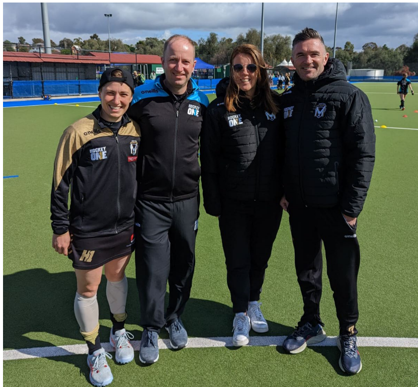
MUHC contingent at Hockey One Finals