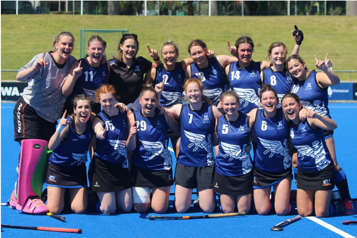
Women's InterVarsity – Champions