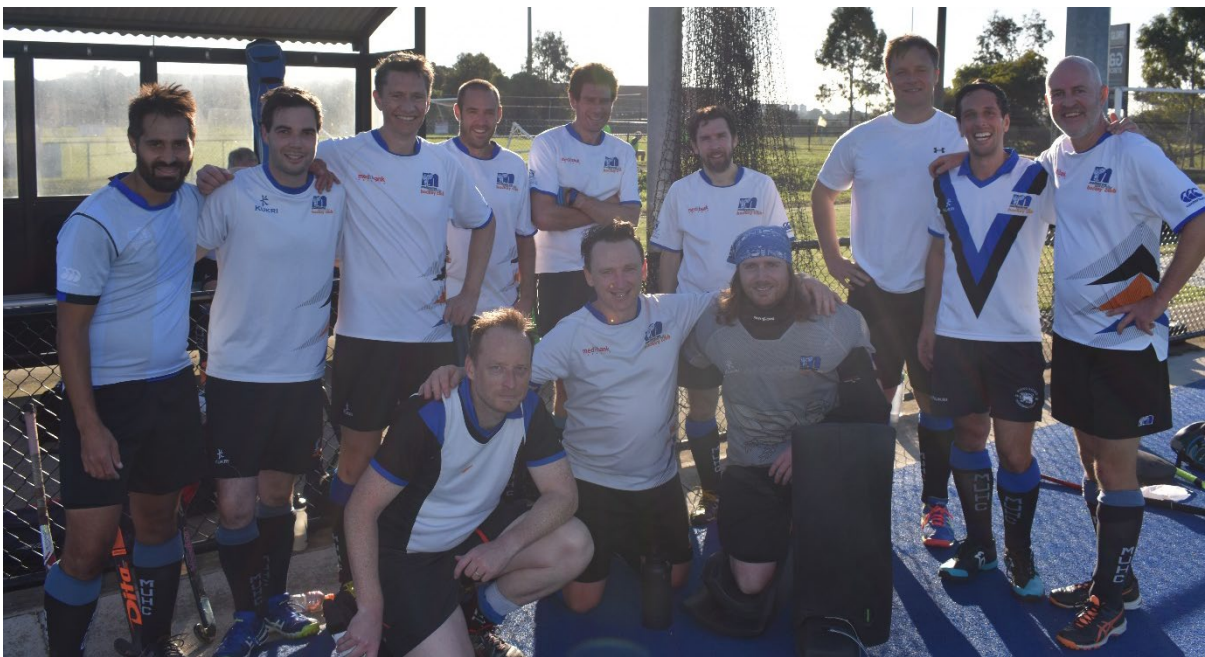
Men's Pennant D