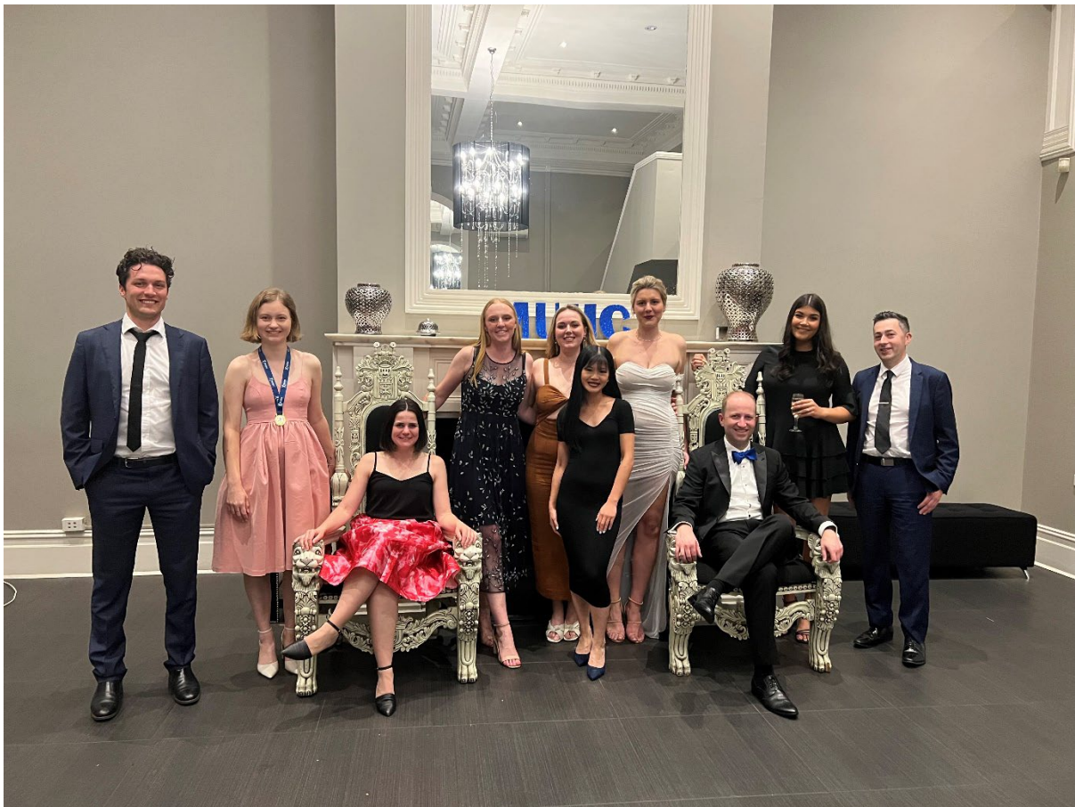
2022 Executive and General Committee