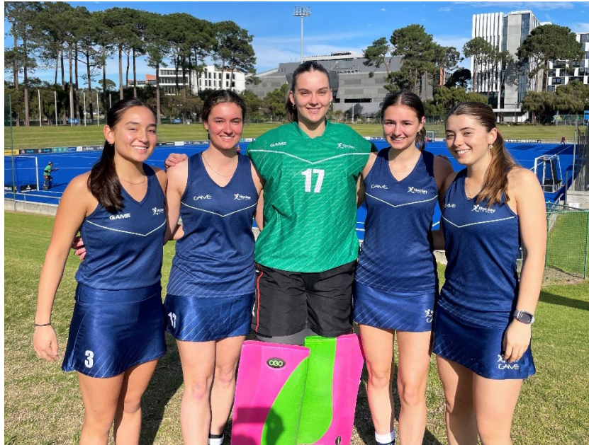
Shoppers at the U21 National Championships