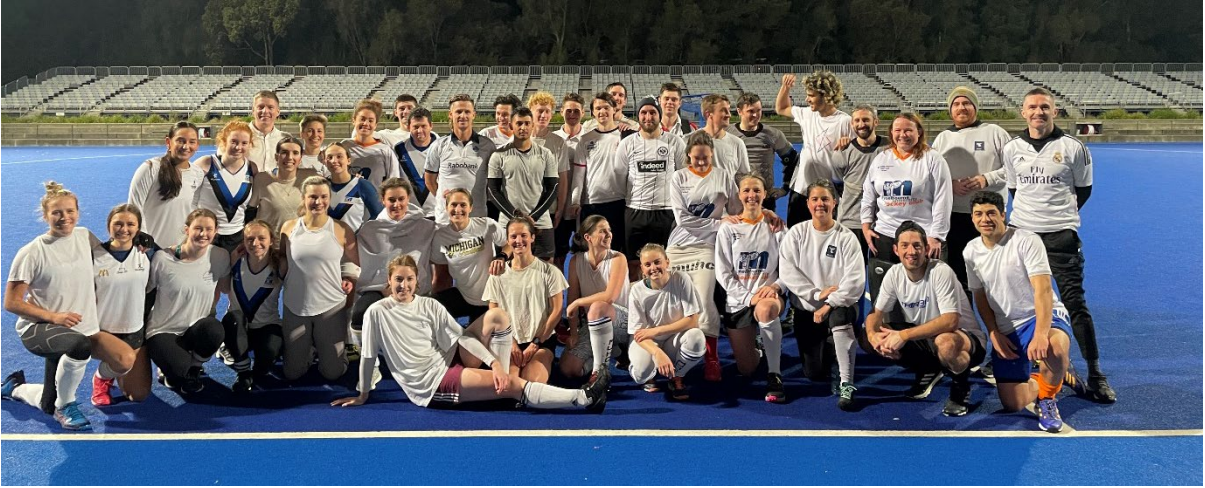
PL/PLR training (Women's Round)