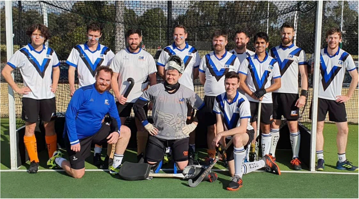
Men's Pennant B (Men's Health Round)