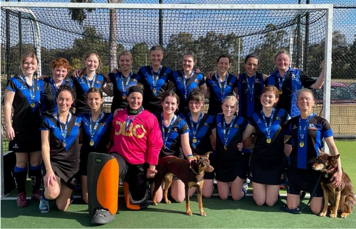
Women's Pennant C – Premiers