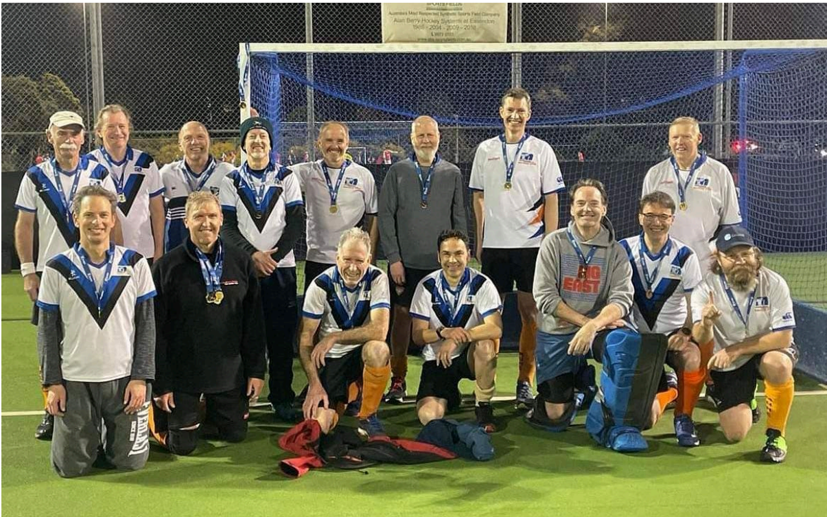
Men's Masters 45+ NW – Premiers