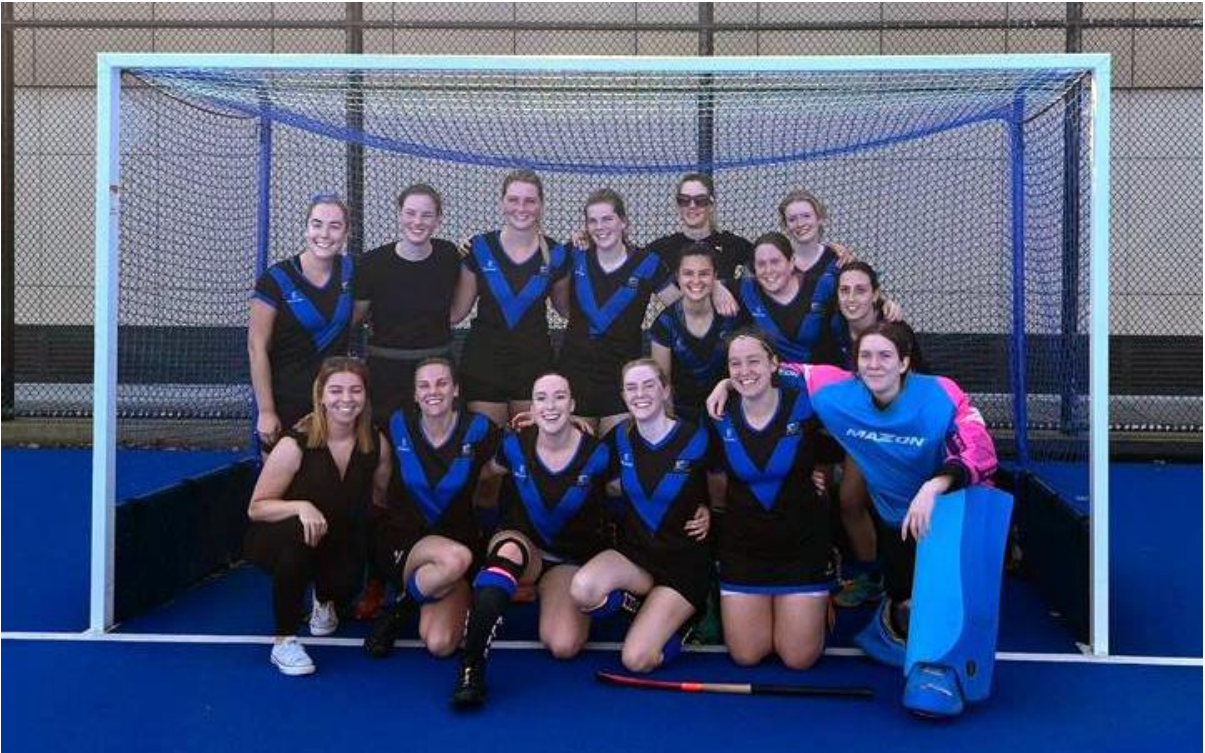
Women's Pennant D