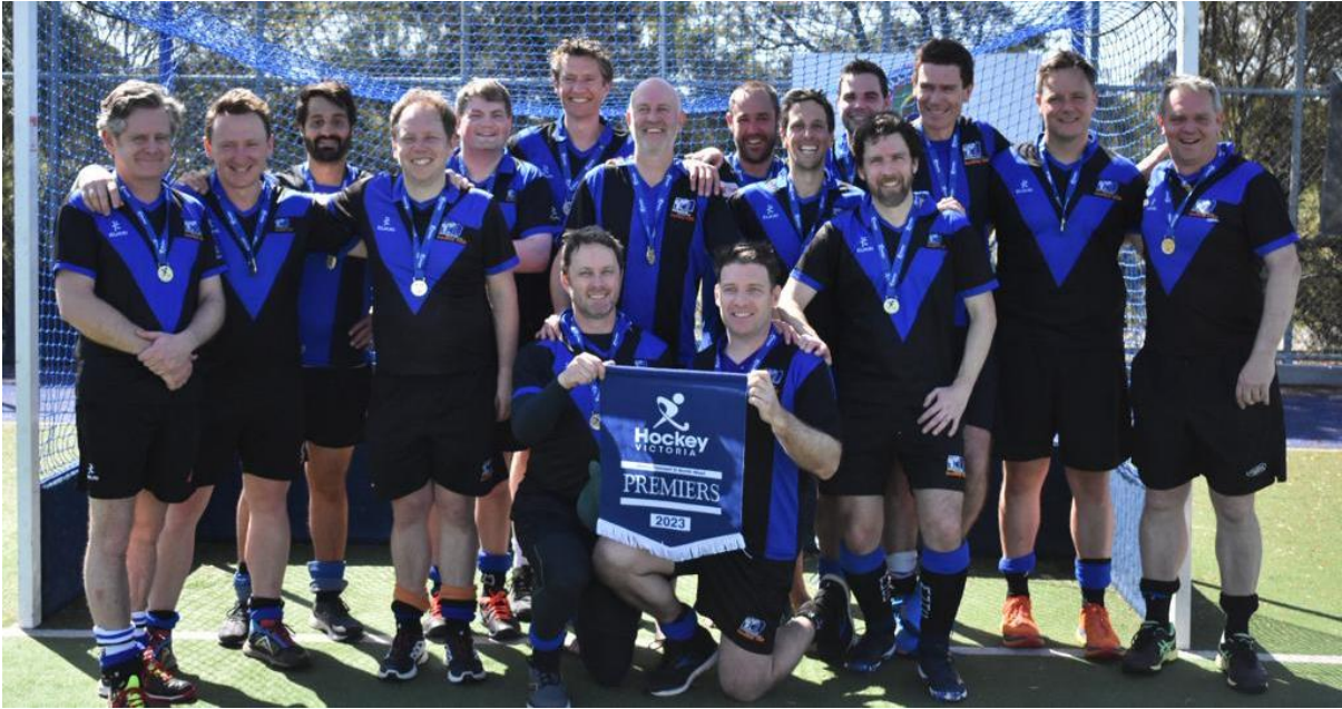
Men's Pennant D North West (Premiers)