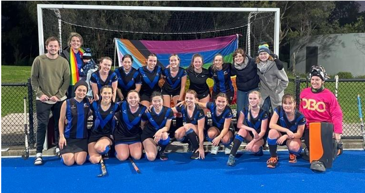
Pride Round : Women's Pennant B