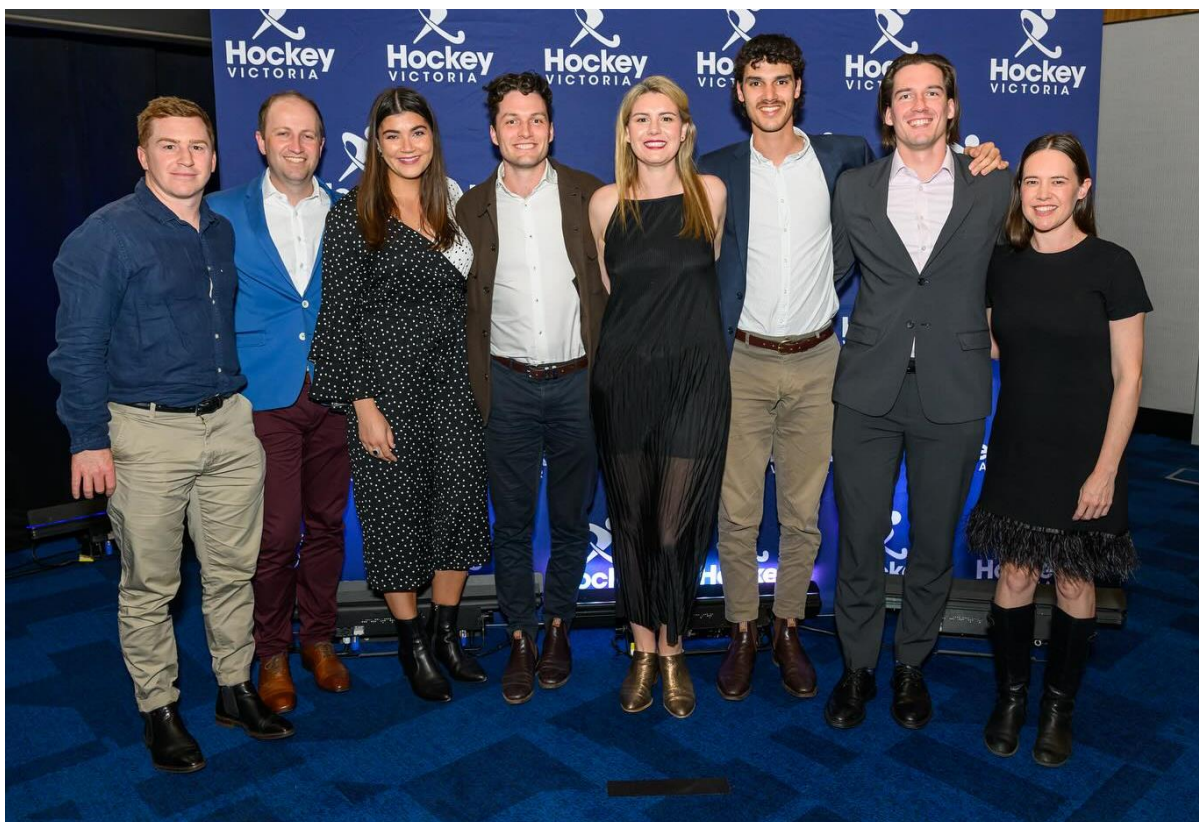
HV Awards Night