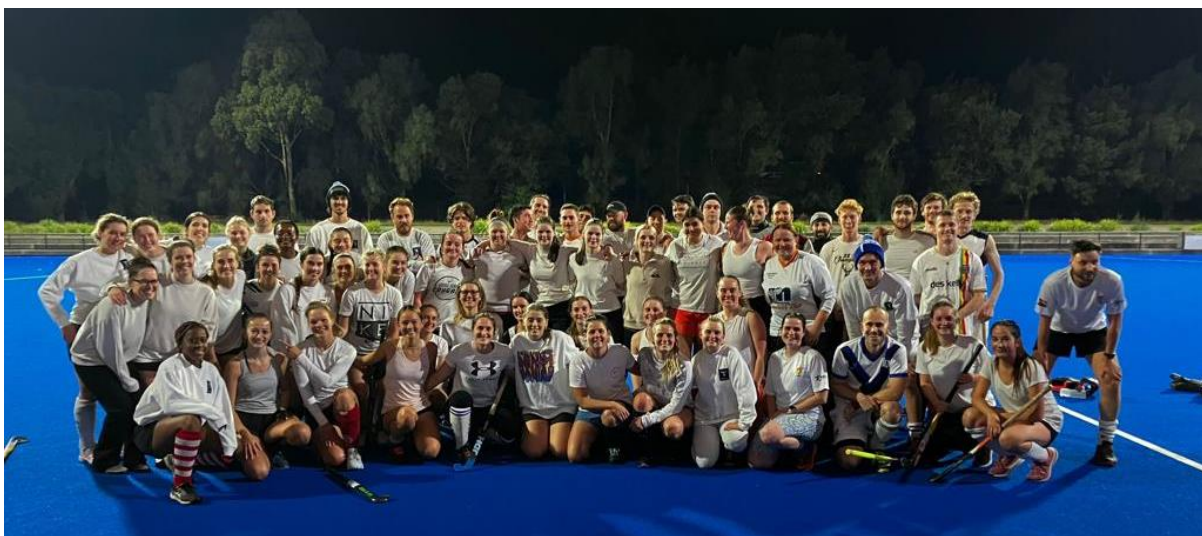
Women's Round: Men's & Women's Premier League & Reserves training