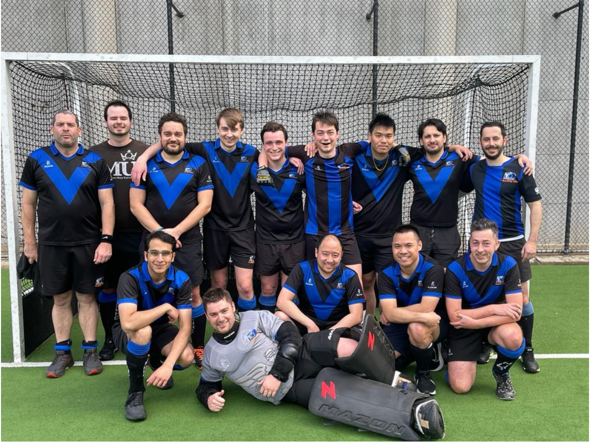
Men's Metro 2