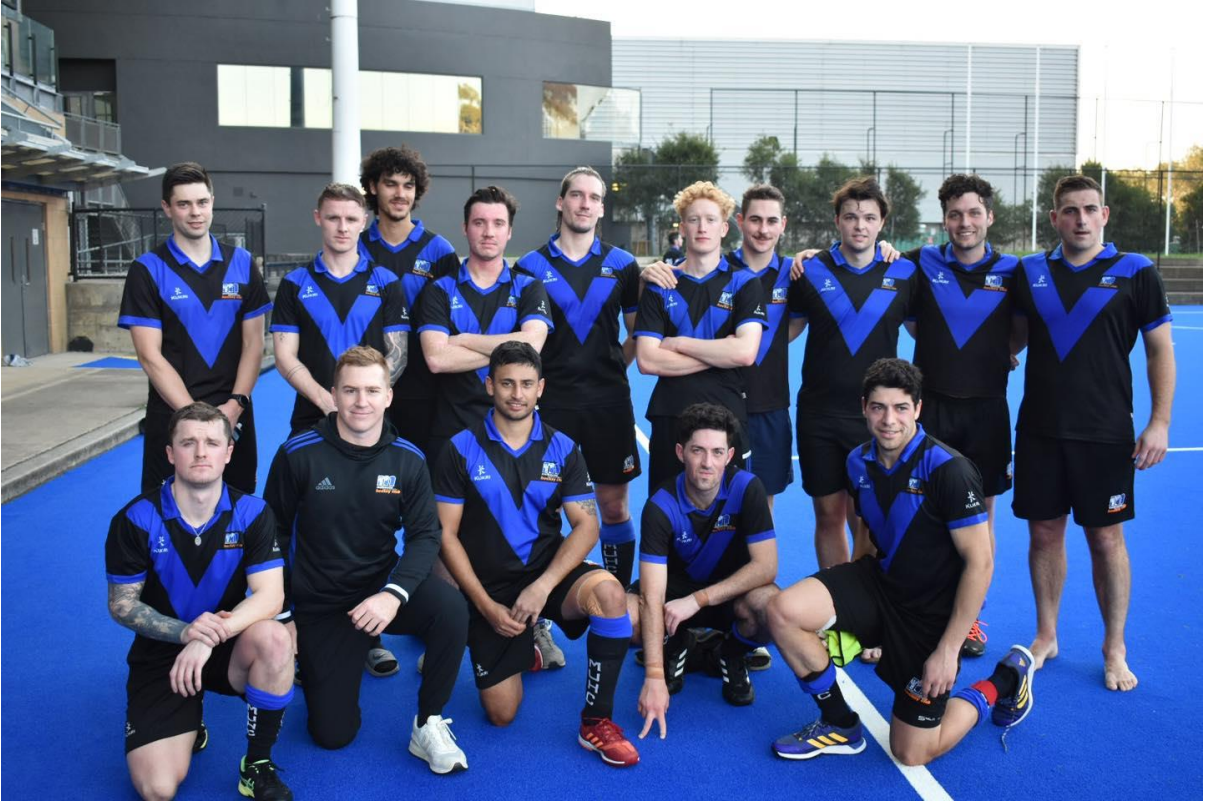
Men's Premier League