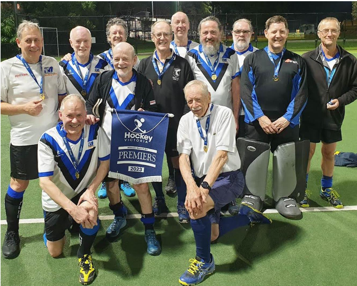
Men's 60+ (Premiers)