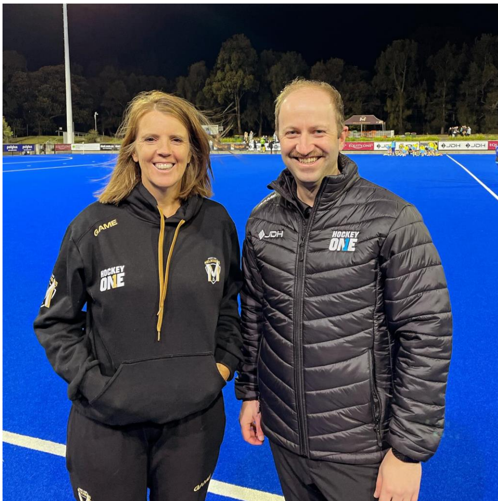
MUHC's Hockey One reps