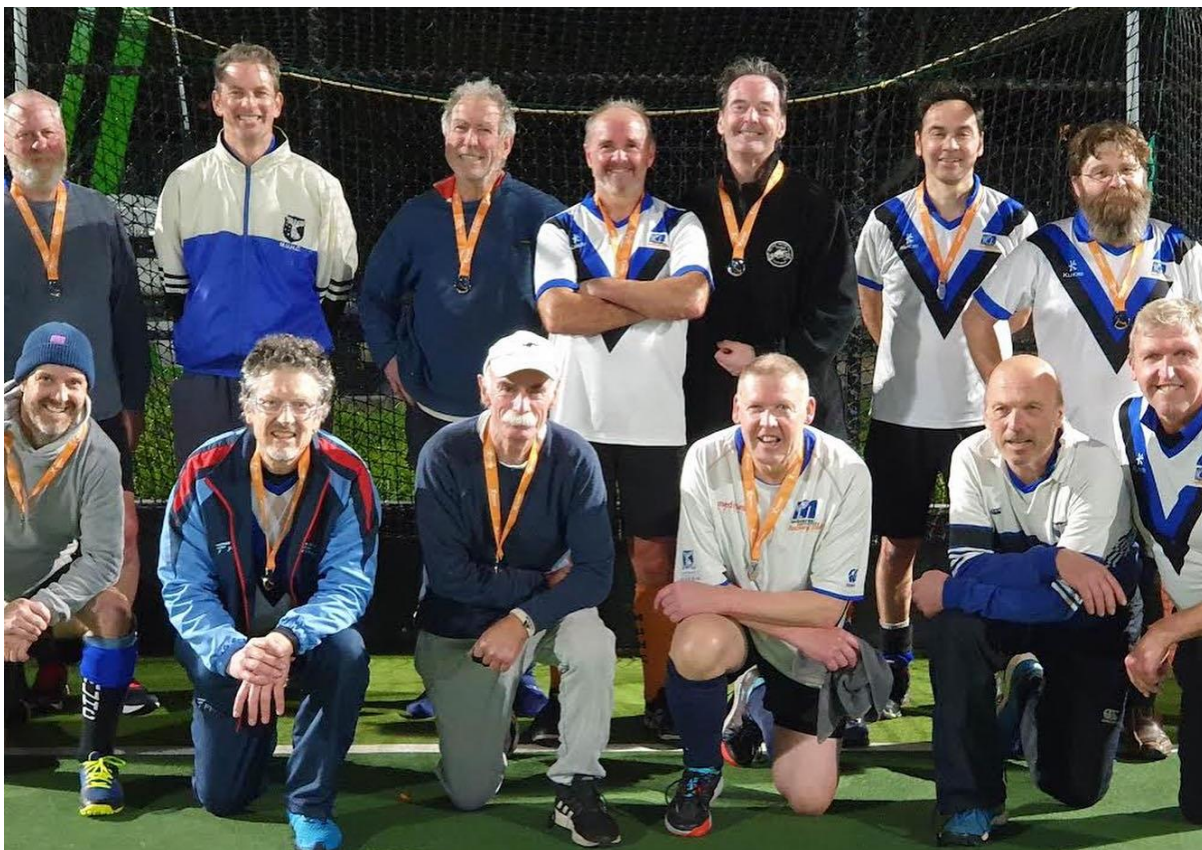
Men's 45+ NW (Runners-up)